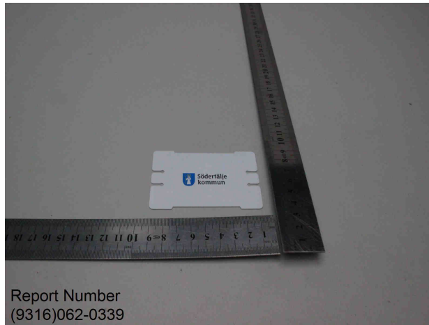
Photo of the Submitted Sample 递交样品照片

LAB NO. 报告号码 : (9316)062-0339-R1 DATE 完成日期 : May 10, 2016 PAGE 页码 : 3 OF 16